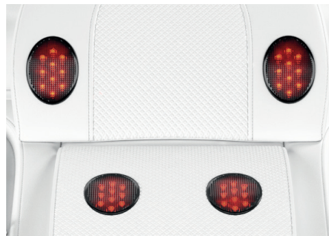
Figure 5: AnduMEDIC. Couch details, infrared part