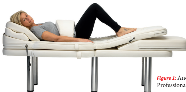
Figure 1: AnduMEDIC Professional in therapy

AnduMEDIC. For clinics, doctors and specialist users for effective pain relief and rapid regeneration with medical certification. Helps to deal with various medical conditions: Back pain, fibromyalgia, osteoarthritis, slipped disc, muscle and neck pain.