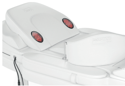
Figure 4: AnduMEDIC. Couch details

In order to recover more quickly, the body requires rapid detoxification, which is something your lymphatic system is responsible for: It removes