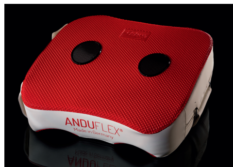
Figure 7: AnduFLEX Pad

waste products such as bacteria, excess moisture and pathogens. Andullation® stimulates the function of the lymphatic system and ensures faster recovery and a better immune system.